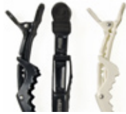
NANOKERATIN HAIR CLIPS CP-1