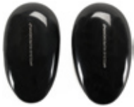
NANOKERATIN EAR PROTECTOR EP-1