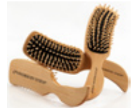
NANOKERATIN HAIR ECO COMB HB-1