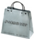
NANOKERATIN GIFT BAG GB-1