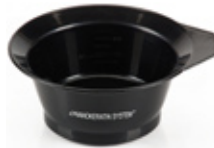
NANOKERATIN HAIR BOWL C-1