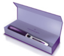
NANOKERATIN HAIR IRON