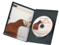
NANOKERATIN DVD NANOKERATIN SYSTEM DVD