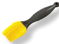
NANOKERATIN SILICON BRUSH B-1