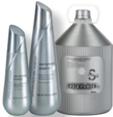
320ml 550ml 5L