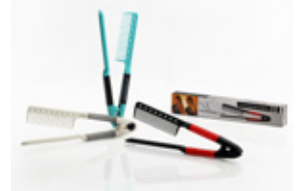
NANOKERATIN EASY COMB HC-1